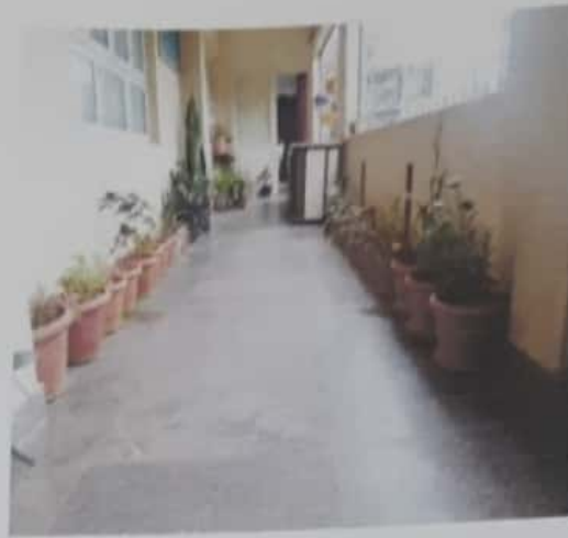
Saplings for Sanjeevini Garden of our College