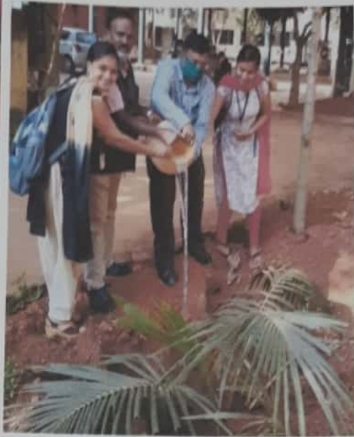
Environment Day marked by Saksaratha Club Watering the plants