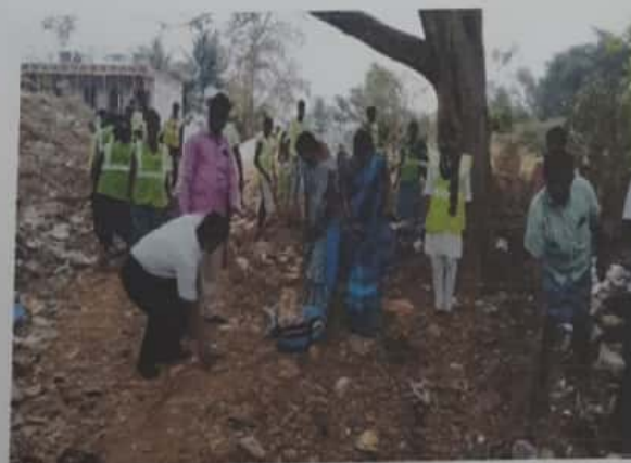
Initiatives beyond the campus at Avalahalli