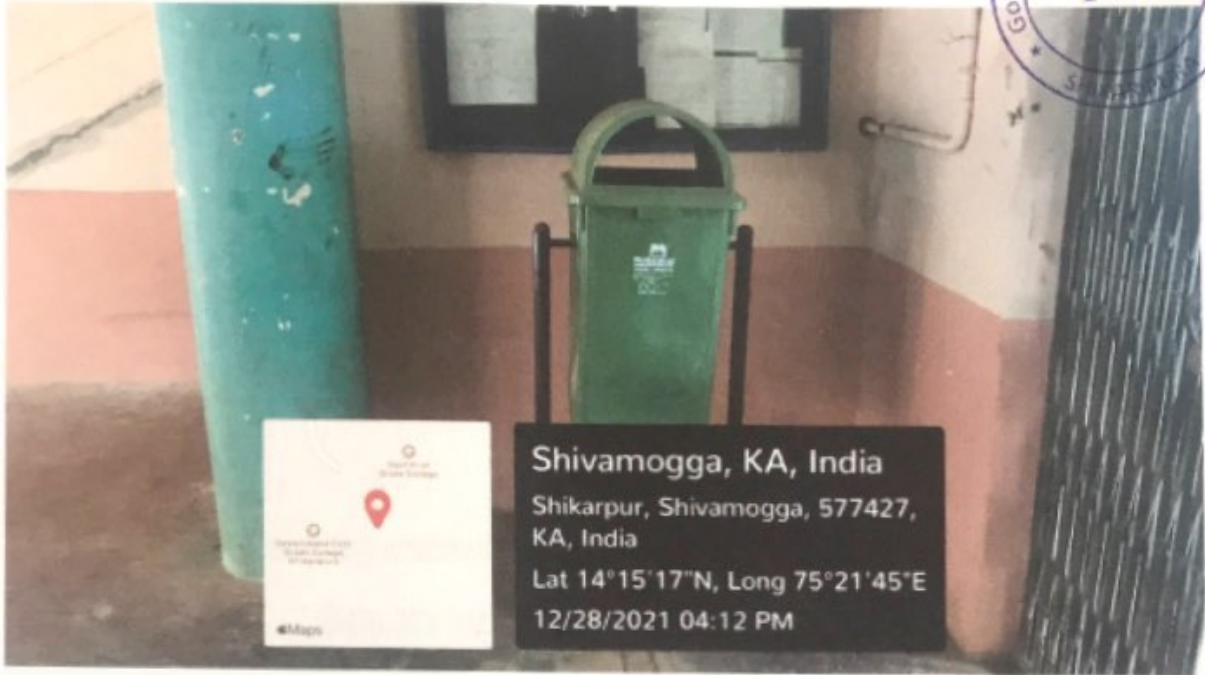
DUSTBIN INSTALLED IN THE ENTRANCE