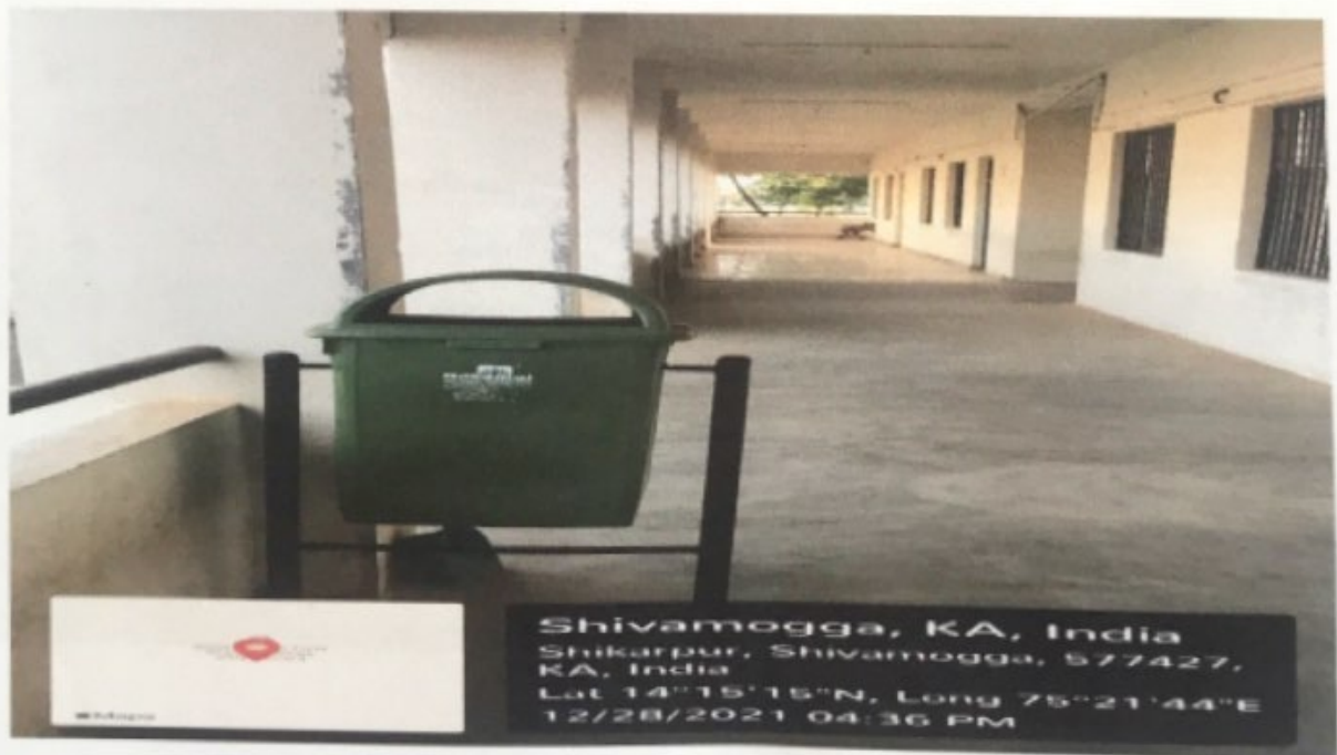
DUSTBIN INSTALLED IN EACH CORRIDOR