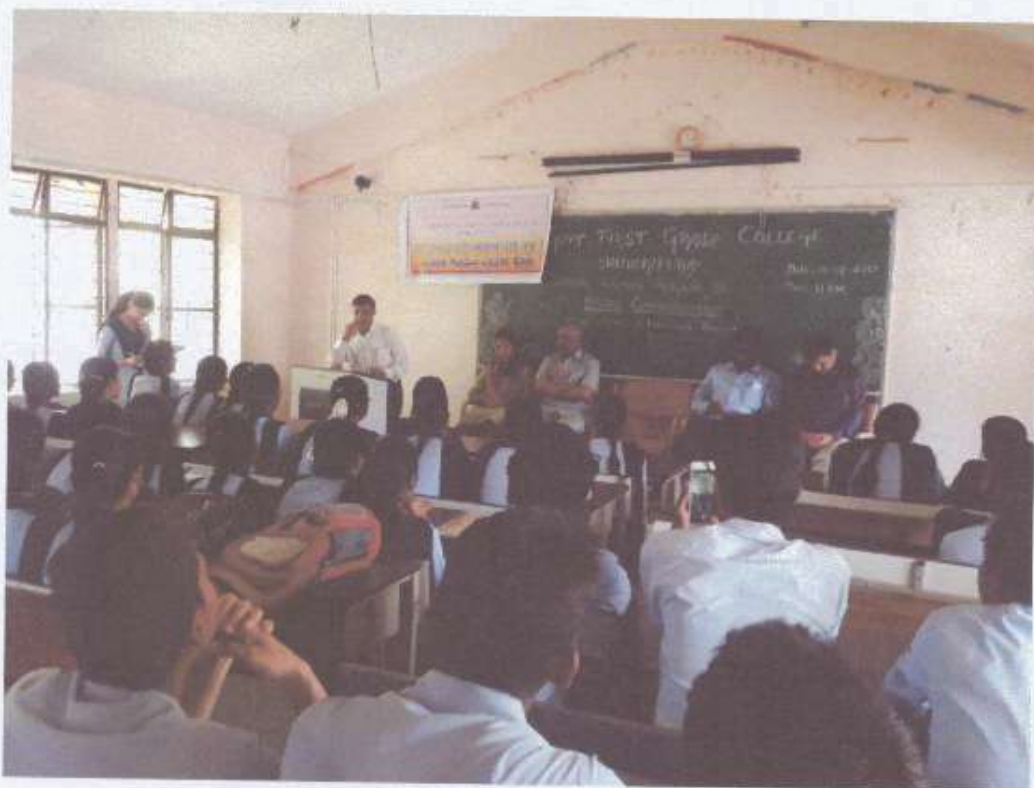
ADDRESSING BY PRINCIPAL