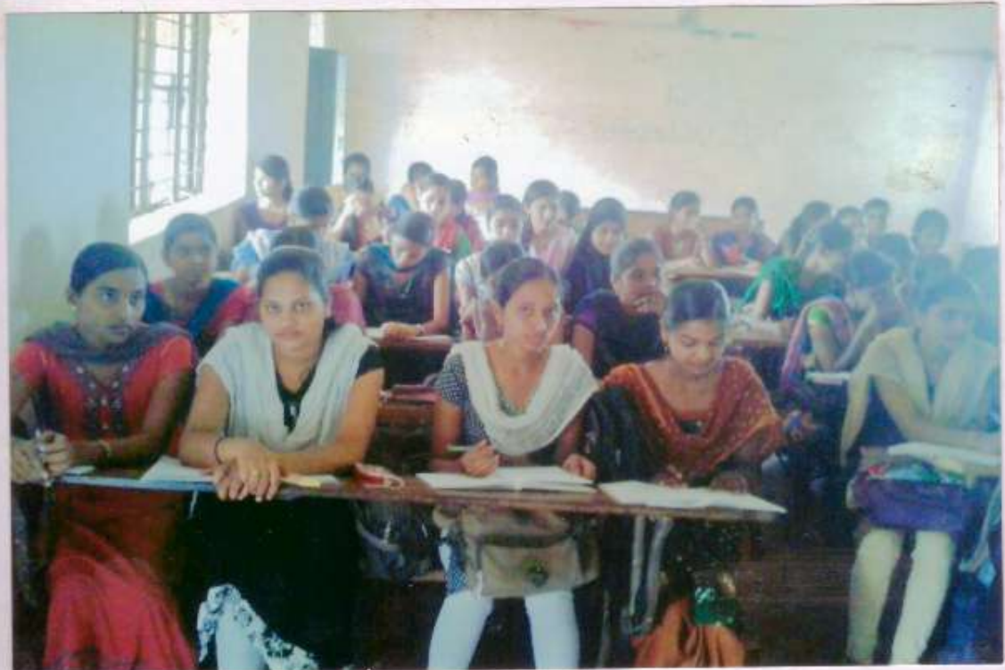
Students Attended the lecture.