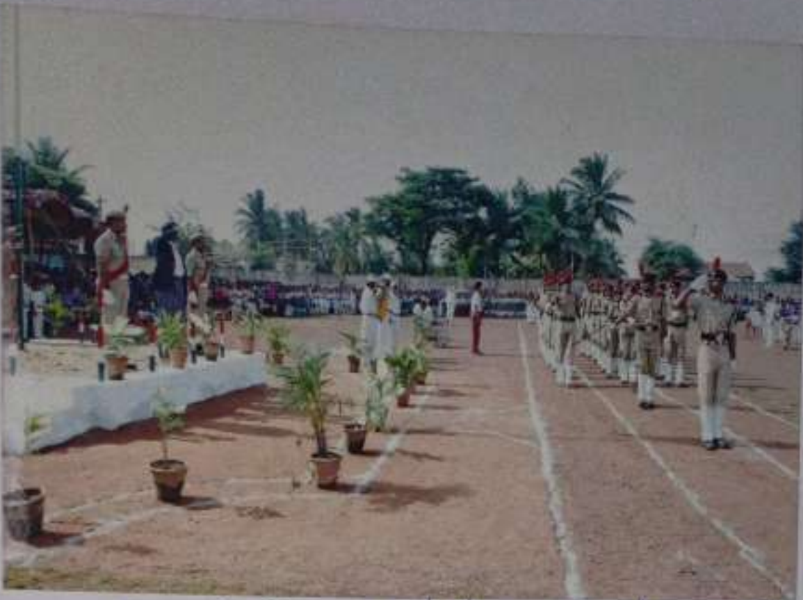
Parade From cadets in Taluka Stadium