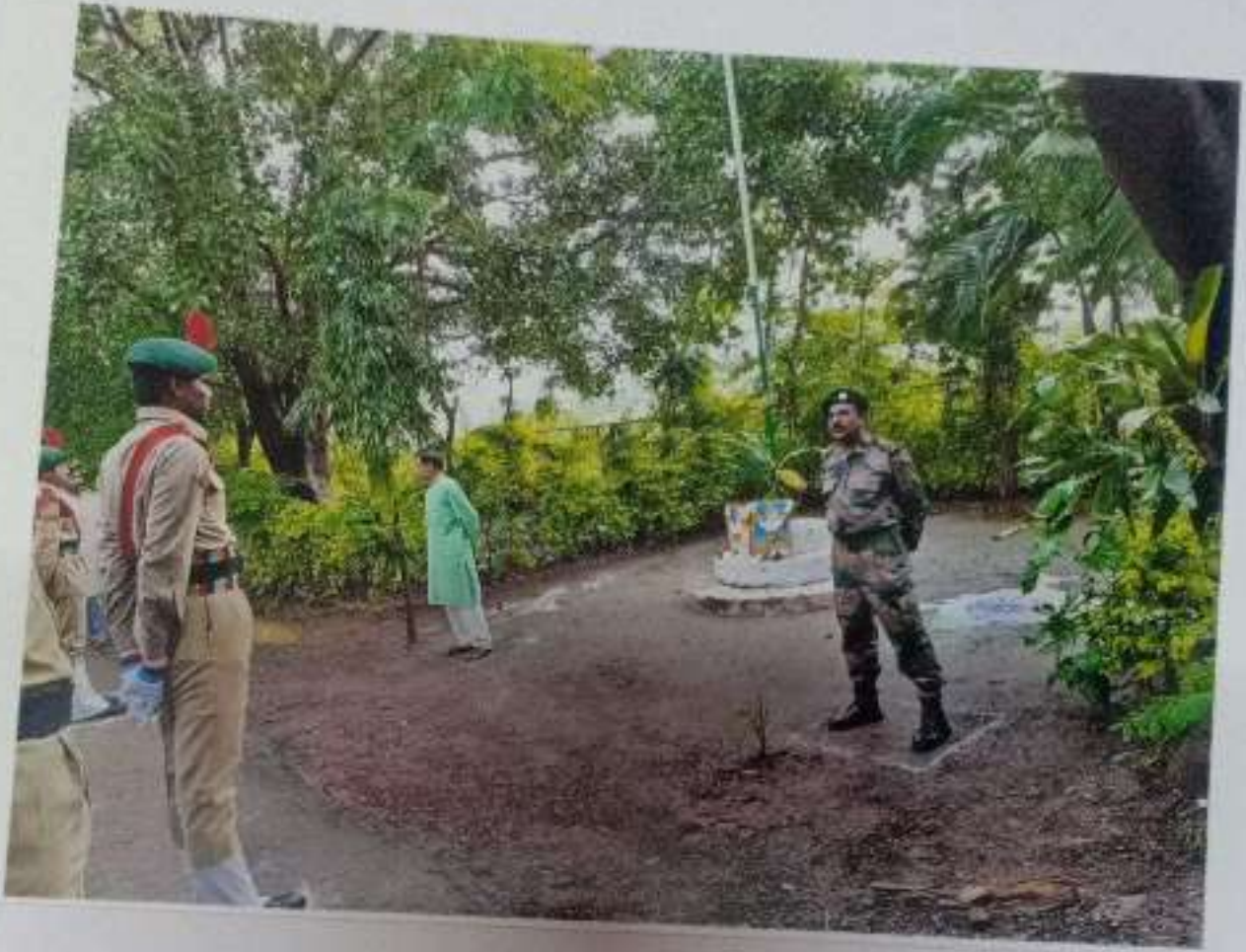
Flag hoisting by principal.