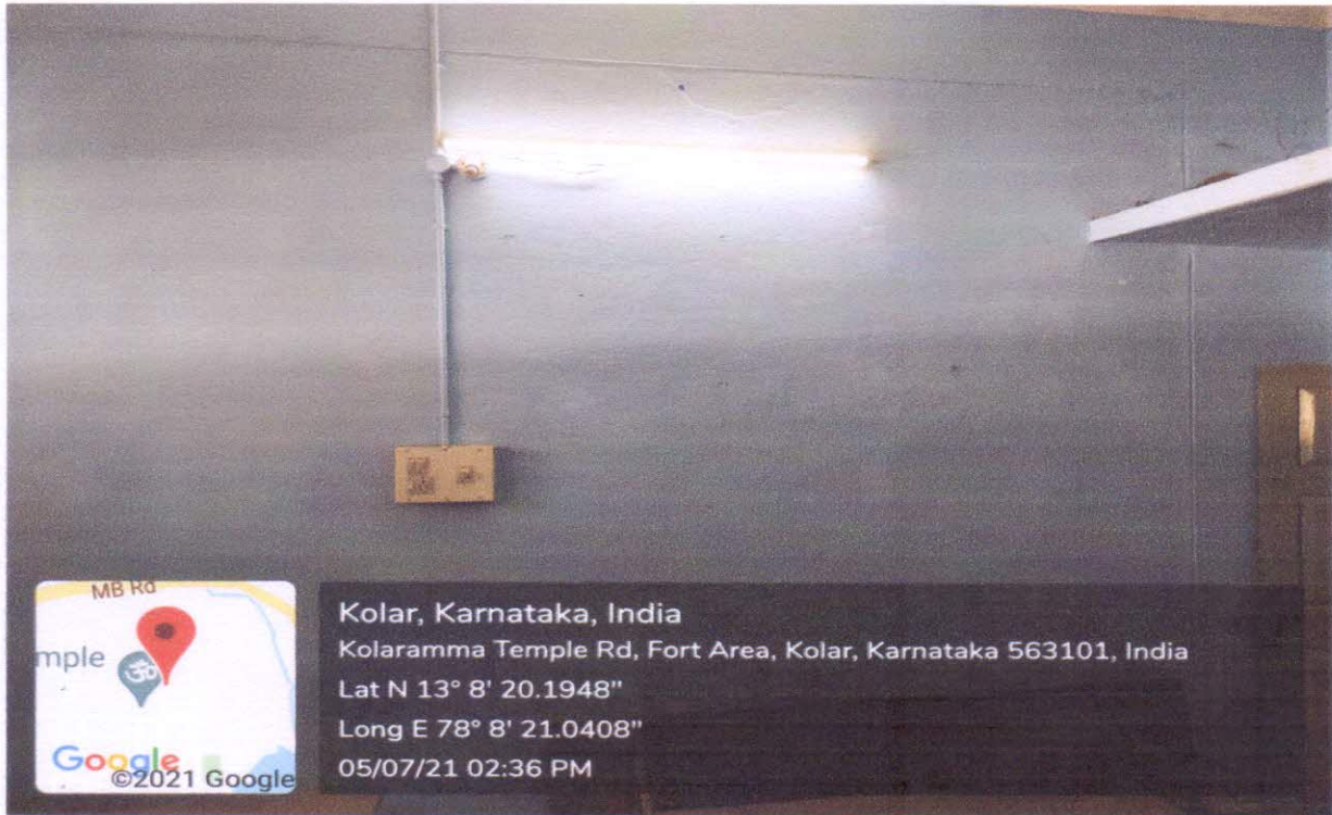
LED BULBS INSTALLED IN THE PRINCIPAL'S CHAMBER

Kolar, Karnataka, India Kolaramma Temple Rd, Fort Area, Kolar, Karnataka 563101, India Lat N 13° 8' 20.1948" Long E 78° 8' 21.0408" 05/07/21 02:36 PM