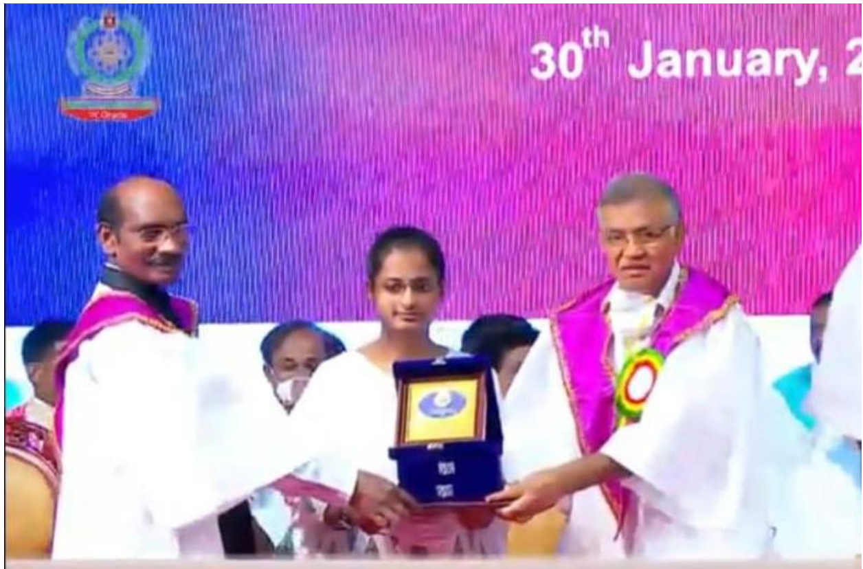
RANK HOLDERS FELICITATED AT BANGALORE UNIVERSITY CONVOCATION

CASH PRIZES AND MOMENTOS WERE GIVEN AWAY ON THE OCCASION