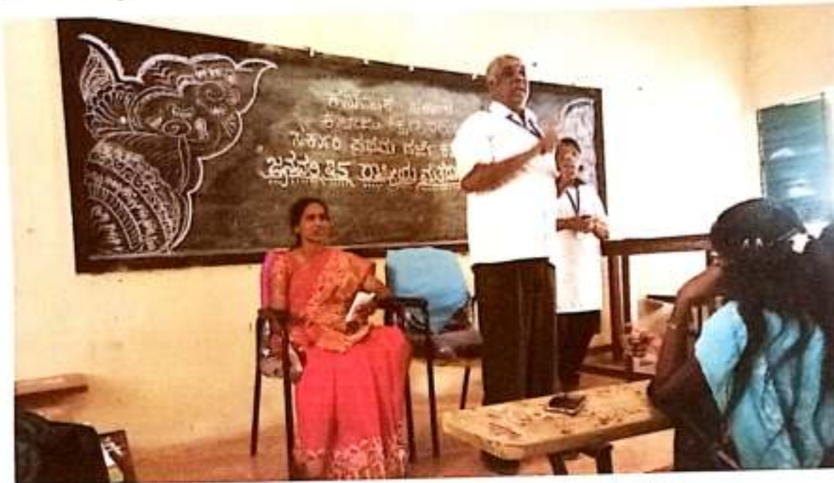
Explaining the History & Importance of Voters Day by Principal