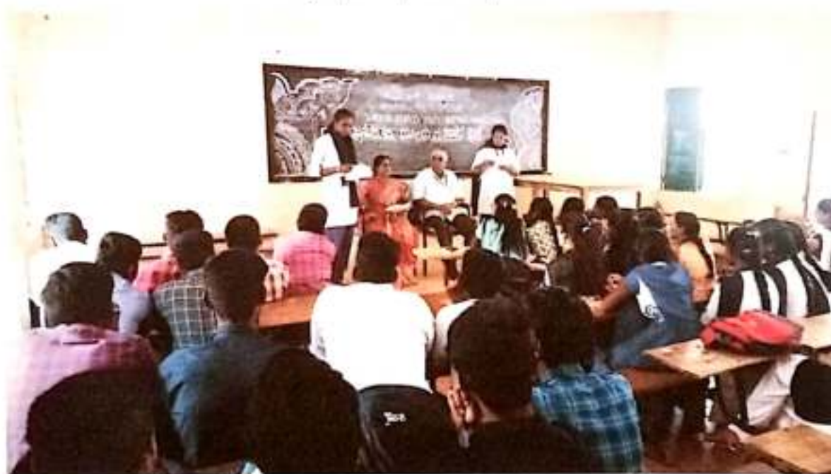
A glimpse of Speech Competition

Principal Government First Grade College Kadugudi, Bangalore - 560 067