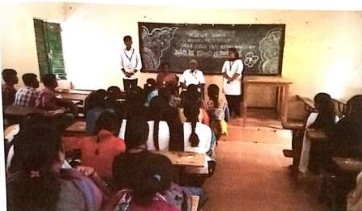
A glimpse of Speech Competition