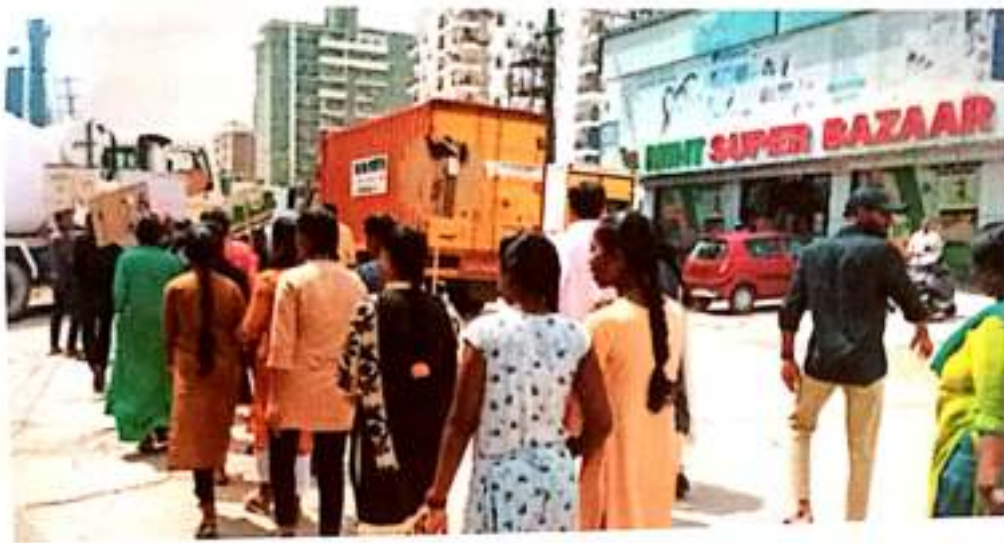
A glimpse of "Drug Awareness Campaign"