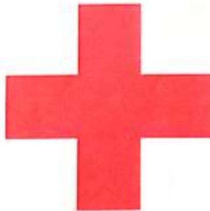
Principal Government First Grade College Kadugudi, Bangalore - 560 067