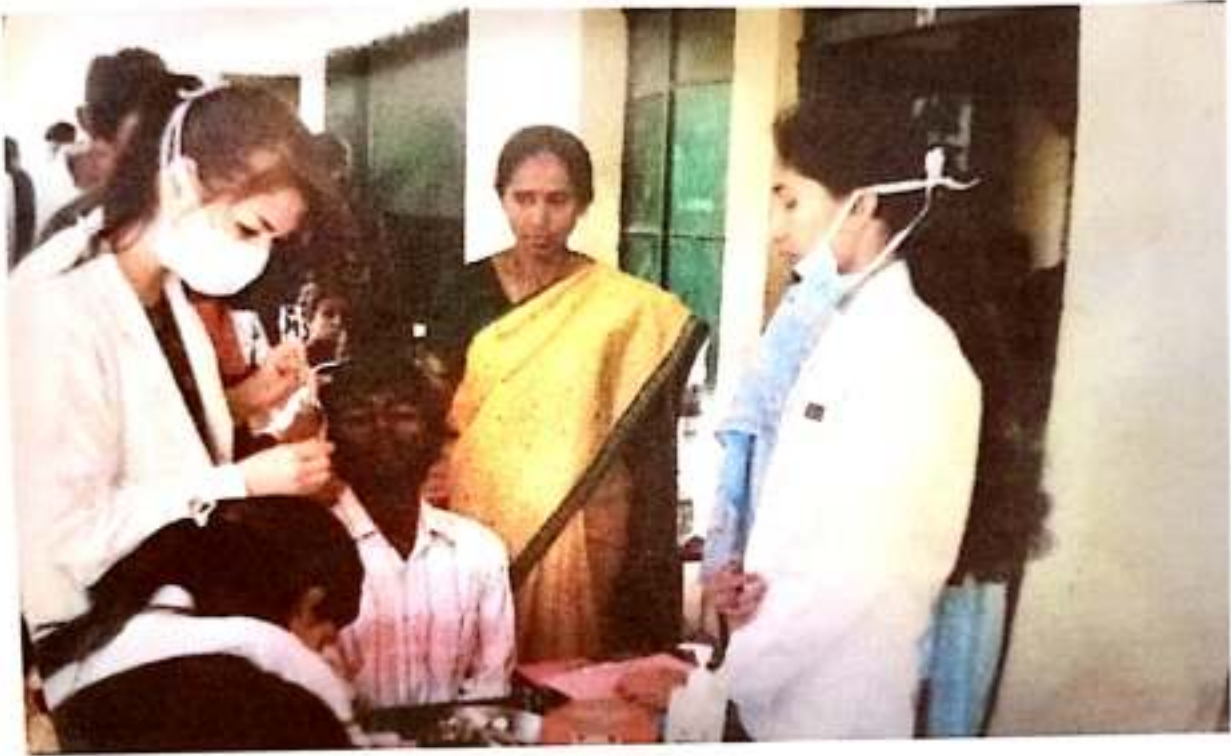
A glimpse of check-up program