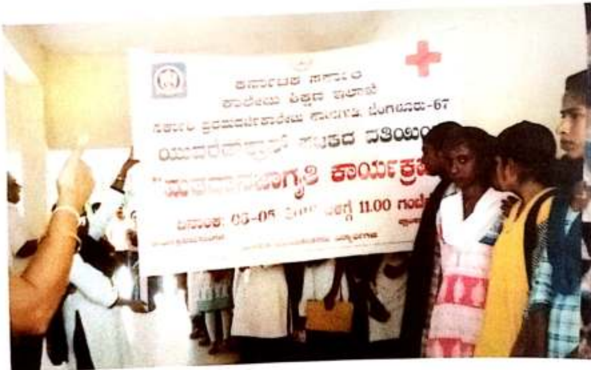
Glimpse Awareness of Voting Campaign