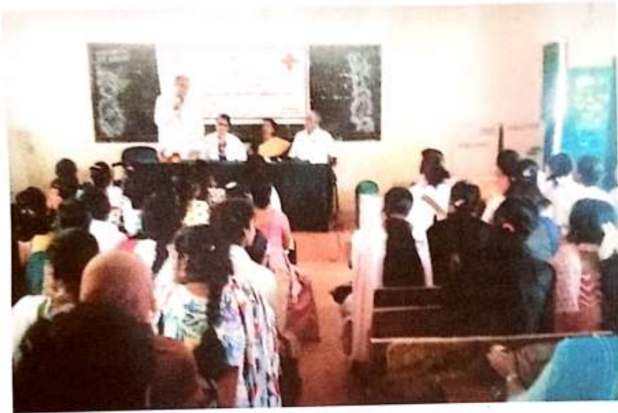
Medical Officer Gives an explanation of why eye care is so important