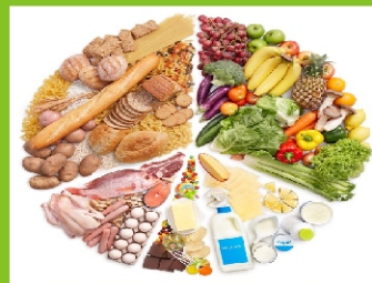
FOOD AND NUTRITION