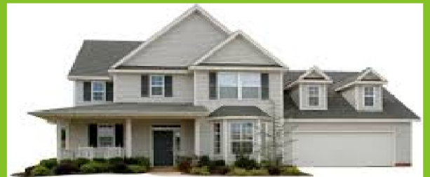
FAMILY RESOURCE MANAGEMENT