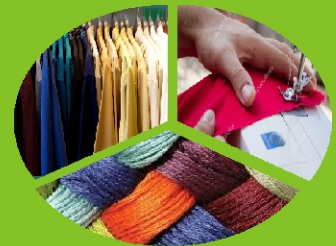
TEXTILE AND CLOTHING