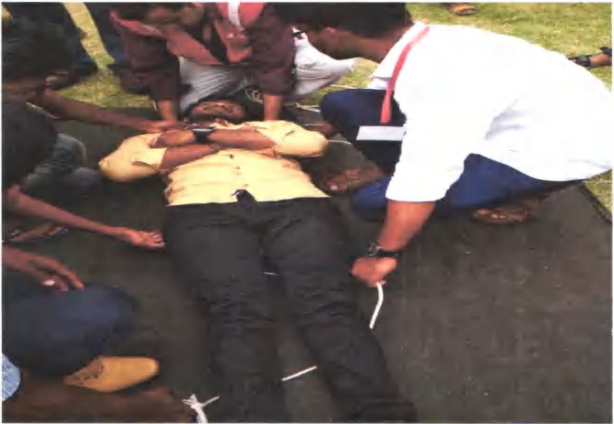
Simple Rescuing techniques using available tools