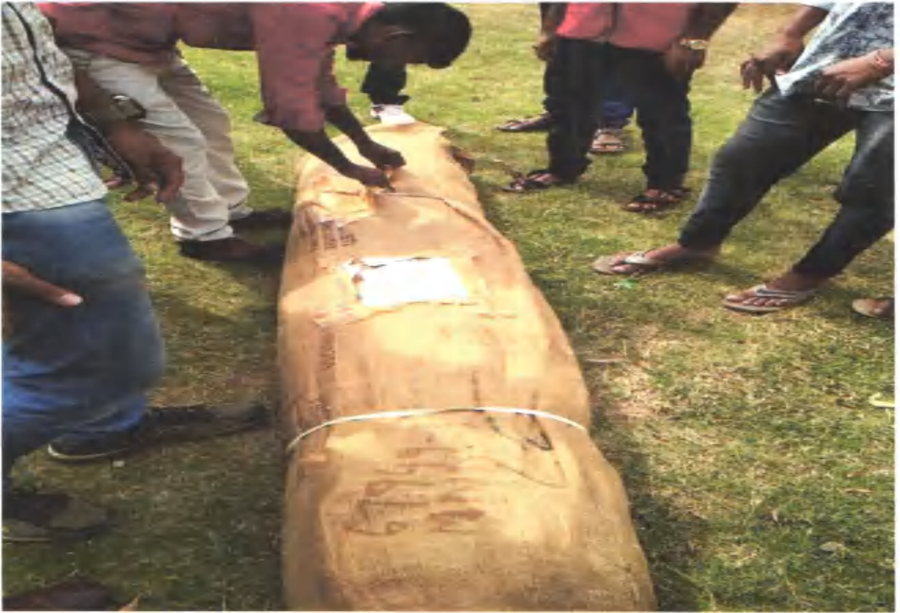
Makeshift tent's pitching