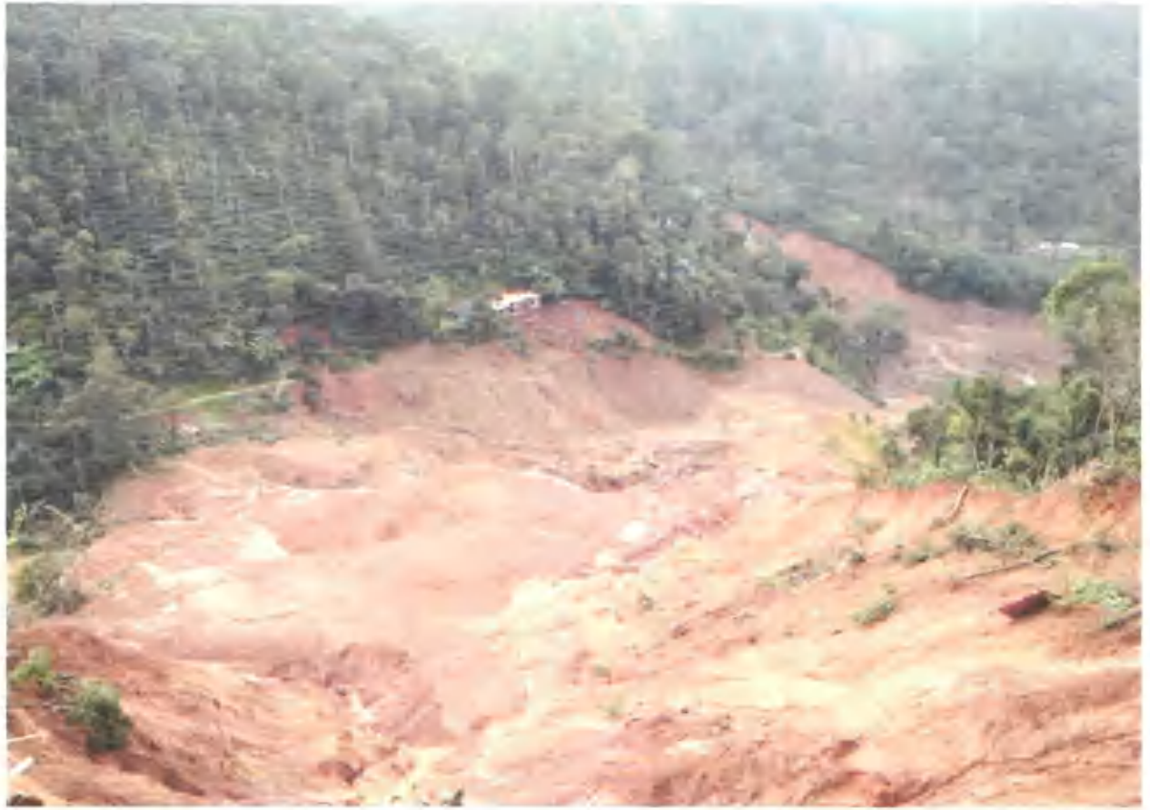
Field visit to assess the extent of the damage